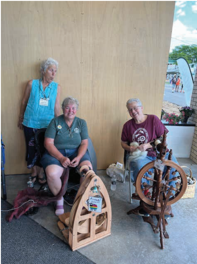
Volunteering at the NY State Fair !